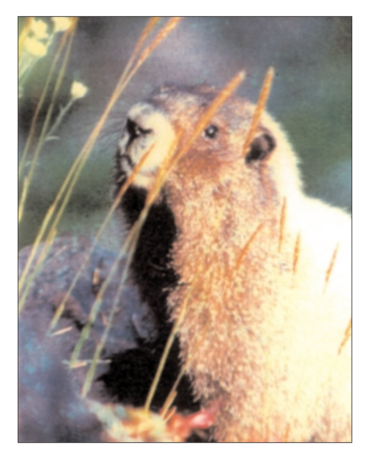
Marmots are found in a variety of locations including the High Cascades.

Wolves, coyotes and cougar are three of the terrestrial predators of marmots. Golden eagles also prey upon them, especially the kits. I suspect this need for being alert is one reason the hoary marmot tolerates such an extended family—father, mother, first year kits and various aunts and uncles. This provides the colony with many pairs of eyes to alert the members to dangers from land and sky. I have noted a variation of the number of marmots on Silver Star over