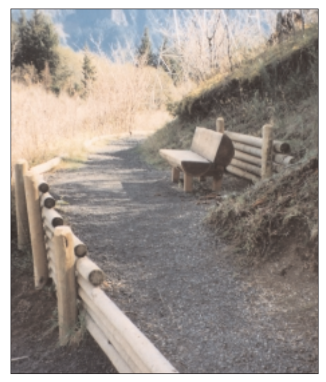
Bench at the Hadley Trail terminus.

The parking fee for participants in the NTD events and work party are waived for this day. Place your invitation or a copy of this newsletter on the dash of your car. This will act as your parking pass.