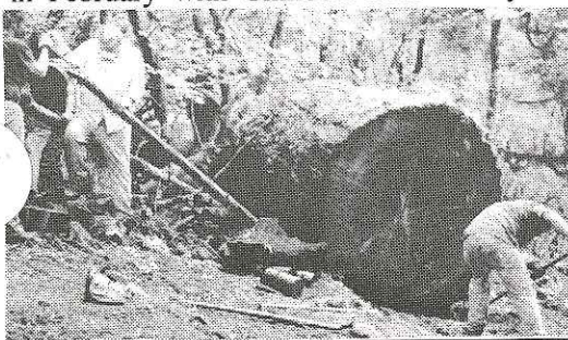
Right: CTA Workparty removing a log.