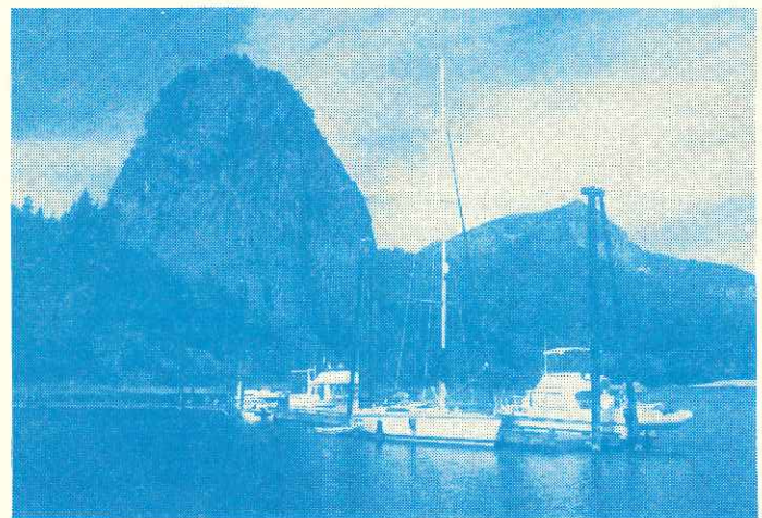
Hike in Beacon Rock State Park following Annual Meeting

Please make reservations on the form included here by November 2nd. For information: Portland, Larry Devroy (503) 652-2241 or (503) 223-6663; Vancouver, Ted Klump (360) 695-7149.