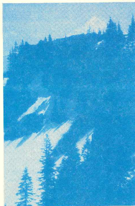
Mt. Hood along Ed's Trail

The terrain is still really rough, but in our first two fall work parties, we pushed the trail through to the arch, well over half