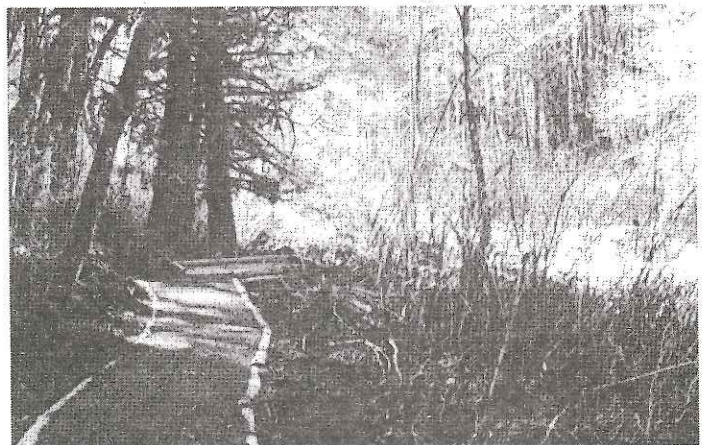
Cedar Creek Falls Overlook, completed and survivor of the flood of '96, awaits the May 4th Dedication and users.