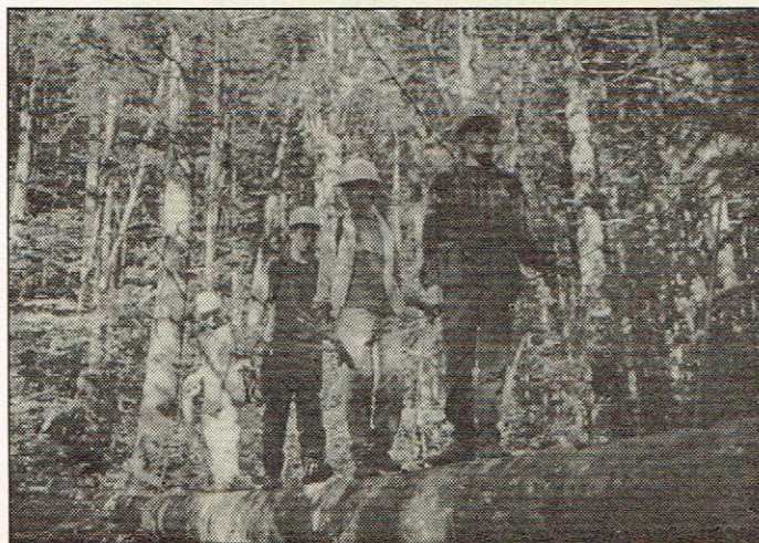
SYEP crossing a log bridge to Bells Mountain Trail.

Washington. The bridge replaced a failed culvert located in the steep area of the Hardy Creek drainage. Pride of crew ownership was quite apparent when the job was done. The crew also brushed several overgrown segments of the trail.