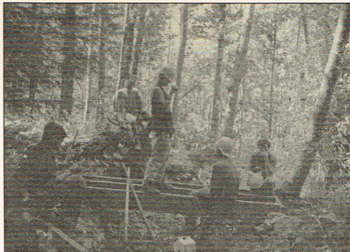
SYEP pausing in bridge construction on Hardy Creek.

In addition to good food and campfire comradeship, the crew