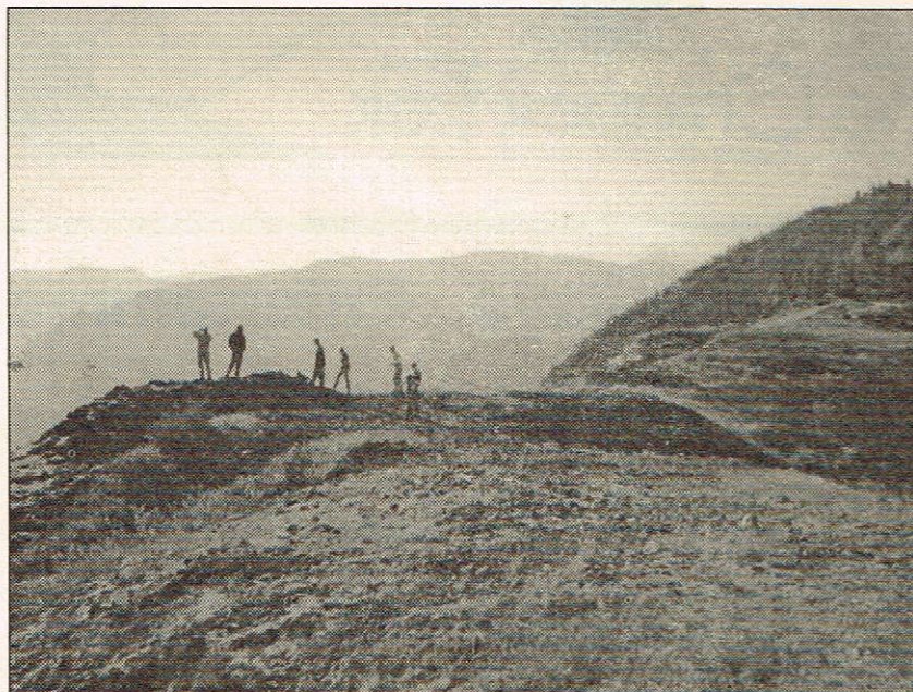
SYEP on Hamilton Mountain Approach.

The SYEP first labored to clear brush on a particularly rough