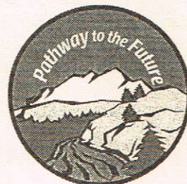
Tee shirt logo design.

Toward the end of the season of work, the crew members enjoyed a celebration pizza feast in recognition of all their good work accomplished. Each crew member as well as participating staff and adults received a new handsome tee shirt.