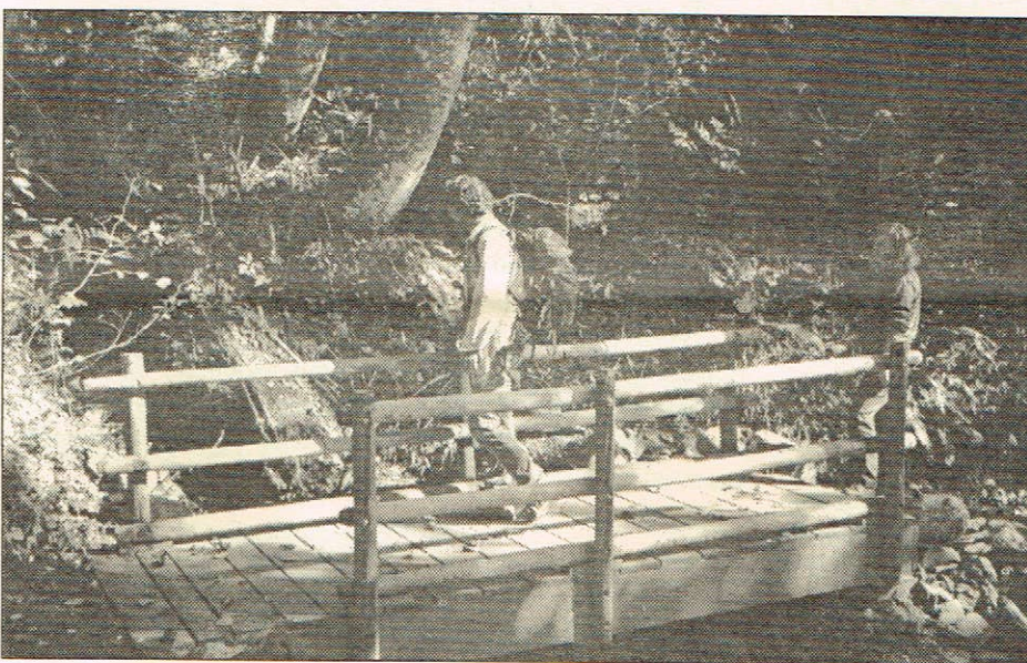
Hikers on newly constructed Hardy Creek Trail bridge.