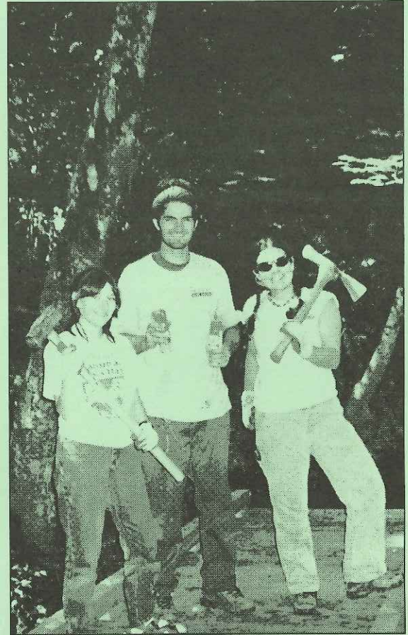
Americorps crew on finished bridge #5 on Bell's Mountain Trail

This fall an Americorps team will assist CTA with bridge construction. Starting in September, they will spend one day per month working on bridge