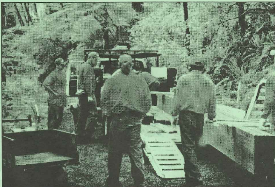
DNR crew moving 25-foot beams for bridge #1 on the Bells Mtn. Trail

Would your family, business, or any organization you belong to like to construct a bridge for us? A brass plaque with the builder's name on it will be affixed to each bridge when the Bells Mtn. Trail project is completed. Step forward and be a part of this legacy by calling the CTA office at 360-906-6769 to sign-up