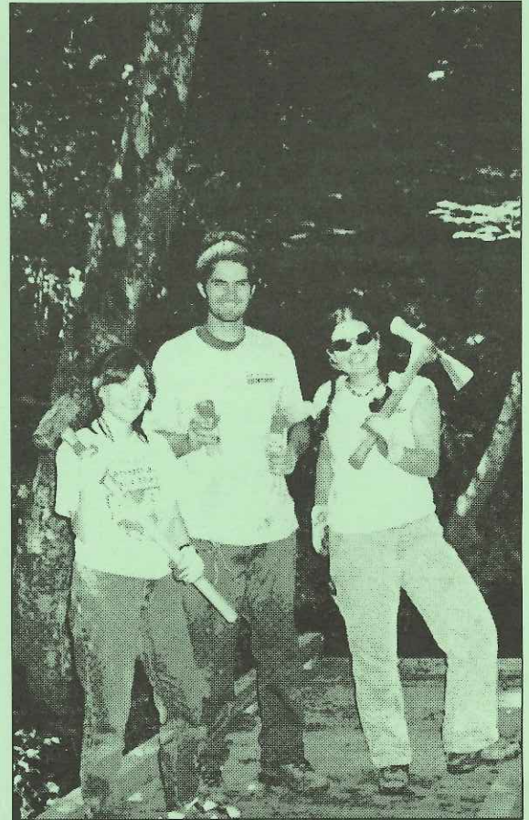
Americorps crew on finished bridge #5 on Bell's Mountain Trail

This fall an Americorps team will assist CTA with bridge construction. Starting in September, they will spend one day per month working on bridge