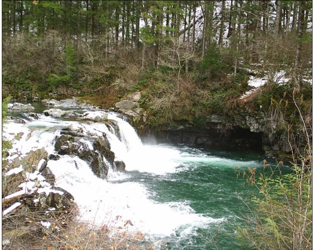
Sunset Falls in the winter time.

Crews are continuing to prepare for the reroute to create a more ADA-friendly Ellen Davis Trail. Gravel has been spread on some of the existing trail meeting these ADA standards. An application for funds to proceed with the work has been made. We anticipate hearing soon when these dollars will be available.