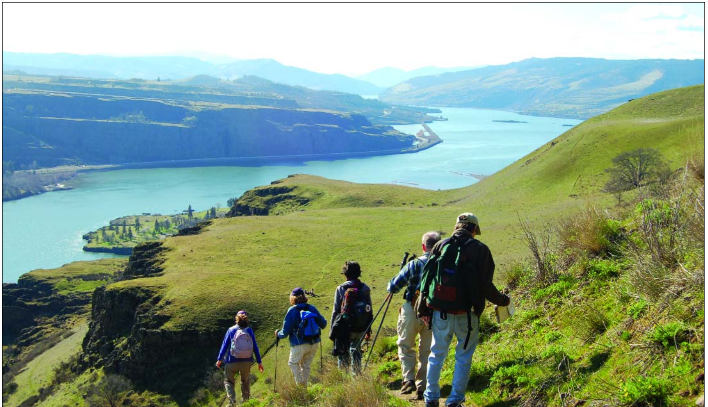
Spectacular views of the Columbia River Gorge as seen from the Cherry Orchard Trail.