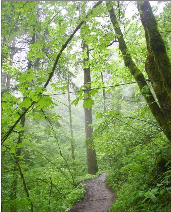
Fog lends beauty to the trees on National Trails Day 2008.