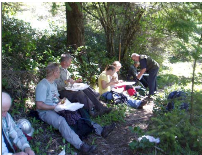
Lunch break along the trail.