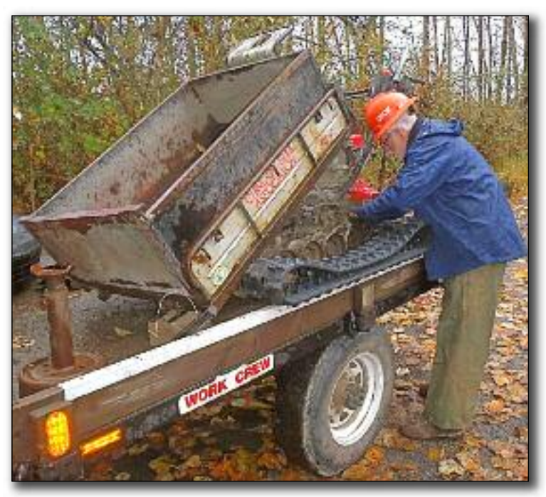
Dick Blackburn installs new track on a CTA tote.

In our last newsletter we made an appeal for funds to purchase track replacements for our Honda Power Carriers (3), referred to as totes. Thanks to the generous donations of some of our members, CTA was able to purchase all new tracks (three sets) for our machines. Our totes are 20-plus years old and have been used extensively in trail construction and maintenance projects. They were in use on new trail construction at Vancouver Lake when one of the tracks broke, so that one was replaced only to have the other one on the same machine break. That machine now has a new set of tracks. When a third one broke it was decided the best thing to do was replace all the old tracks without which the totes are basically useless. Thanks to all of you who donated funds for this endeavor, and to Dick Blackburn (featured in this photo) for being the chief mechanic on the track replacement project.