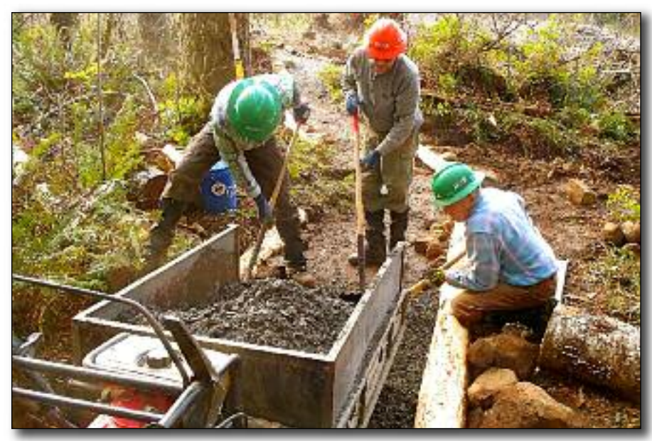
Washington Trails Association Crew