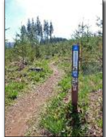
Tarbell Trail

After putting in a morning's work on the trail, CTA will host a