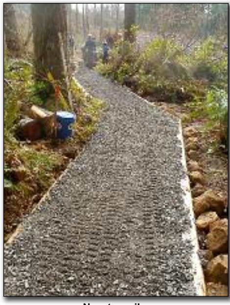
New turnpike